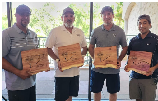
Congratulations to our first place team!