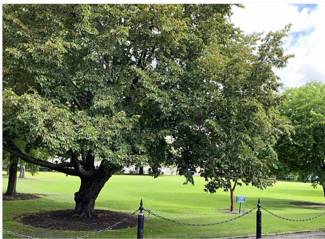
Scientific studies have documented many benefits of interactions between people and plants, even passive interactions, such as walking through a park or viewing nature