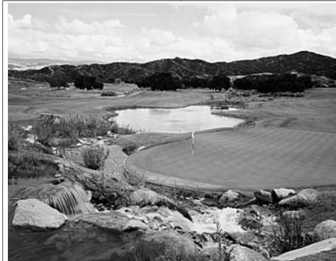
Valley Course Hole #18, Par 5

THIS PAR THREE BEGINS WITH A LONG SHOT OVER WATER. THE RIGHT SIDE AND BEHIND THE GREEN IS FRAMED BY VERY LARGE OAK TREES. THE GREEN IS LARGE AND FAIRLY FLAT WITH SUBTLE MOVEMENT. IN THE EARLY MORNING AND LATE AFTERNOON, MOST OF THE GREEN IS COVERED BY SHADOWS.