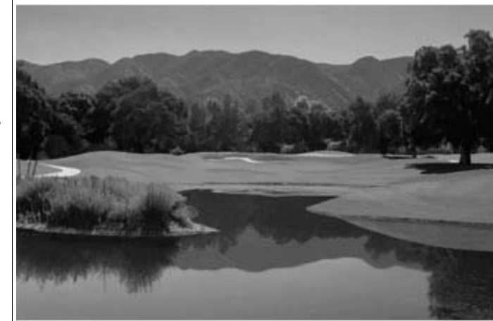
Mountain Course Hole #6, Par 3

Creation of Wetland Habitat was done for the purpose of attracting birds and other wildlife as well as for the enhancement of the golf course. Whether its creation is regarded as a golf enhancement or as a benefit to nature, it is apparent that over 50% of this wetland habitat created can be appraised as possessing elevated habitat values because it situates within alluvial fan sage scrub habitat. Oaks as well as the other valued components of alluvial fan habitat are present along the margins of much of wetland habitat, and so these acreage's are assessed towards the mitigation of oak tree losses at Robinson Ranch.